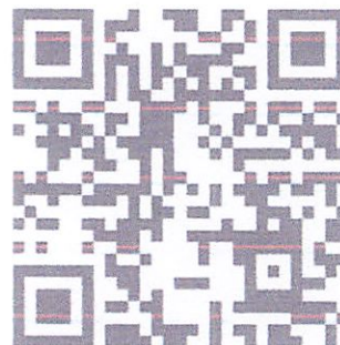
Submission Bin for Regional Summary Data