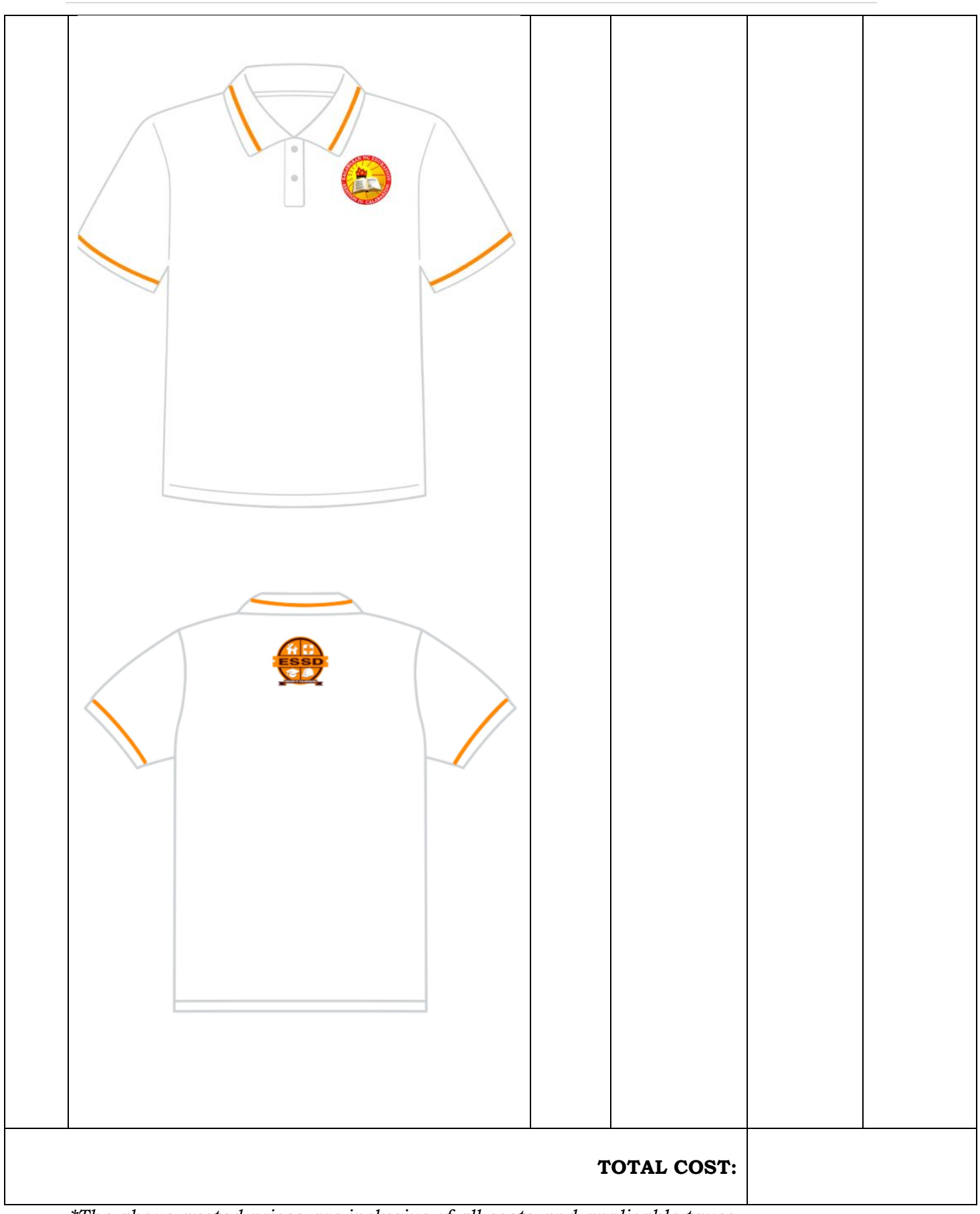
*The above quoted prices are inclusive of all costs and applicable taxes.