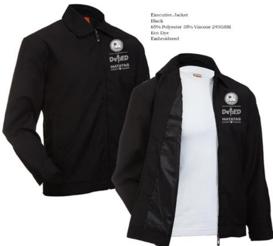
Executive Jacket Black 65% Polyester 35% Viscose 240GSM Eco Dye Embroidered