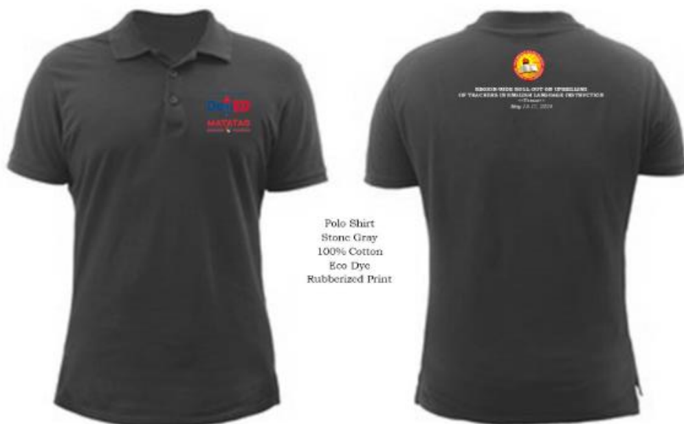
Polo Shirt Stone Gray 100% Cotton Eco Dye Rubberized Print