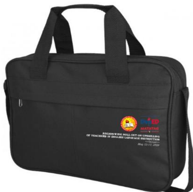
Double Curve Conference Bag High Quality Canvass Rubberized Print

*The above quoted prices are inclusive of all costs and applicable taxes.