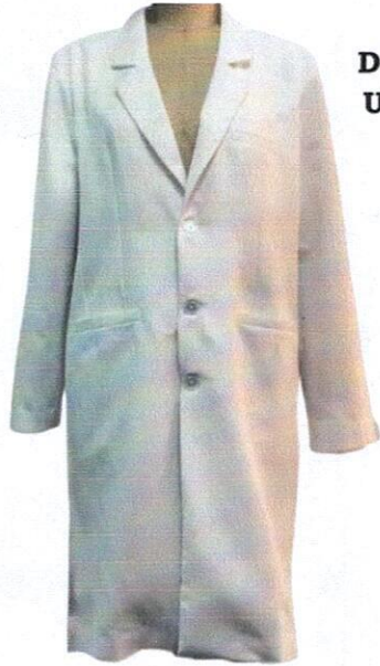
Design of Uniform