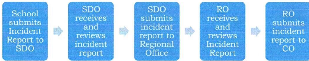
Process flow of submission of Incident Report