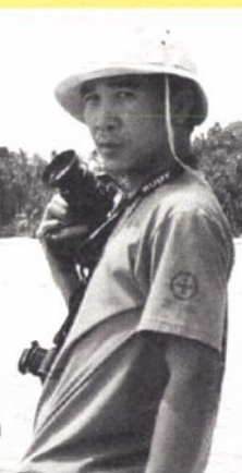
Jimmy Domingo Photojournalism